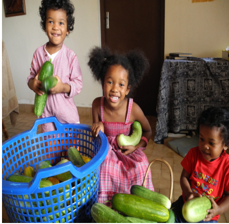
The Samoutou Farm & Food Distribution Team